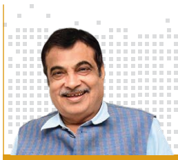
Mr Nitin Gadkri

Hon'ble Minister of MSMEs and Road Transport & Highways, Government of India