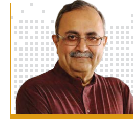
Mr Saurabh Bhai Patel

Hon'ble Minister of State for Finance and Corporate Affairs, Government of India