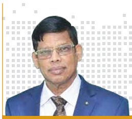
Mr Upendra Tripathy

Hon'ble Minister of Energy, Government of Gujarat