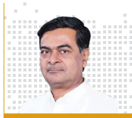
Mr RK Singh

Hon'ble Minister of Railways & Commerce & Industry, Government of India