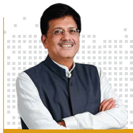
Mr Piyush Goyal

Hon'ble Minister of MSMEs and Road Transport & Highways, Government of India