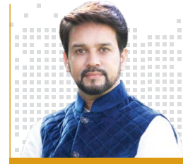
Mr Anurag Thakur

Hon'ble Minister of State (IC) of Power and New & Renewable Energy & Minister of State (Skill Development), Government of India